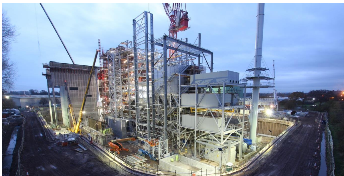
Envirecover Energy from Waste facility under construction.

Since publication of the Strategy, the Partnership has made significant progress in plans to divert residual waste from landfill. Worcestershire County Council and Herefordshire Council have a long term contract with Mercia Waste Management (MWM) for the delivery of their responsibilities as Waste Disposal Authorities. As part of the contract, MWM obtained planning permission, has managed the construction of and is now operating, an Energy from Waste (EfW) facility at Hartlebury. This facility will divert an additional 200,000 tonnes of municipal waste from landfill.